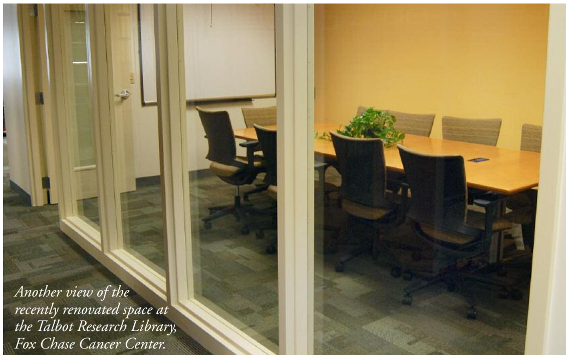
Another view of the recently renovated space at the Talbot Research Library, Fox Chase Cancer Center.