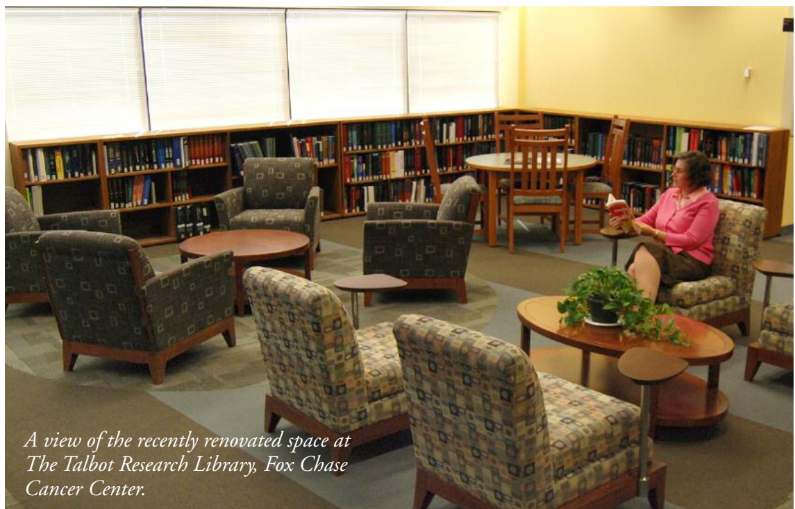
A view of the recently renovated space at The Talbot Research Library, Fox Chase Cancer Center.

The Talbot Research Library, Fox Chase Cancer Center, Philadelphia, has a new look. By acquiring additional electronic resources and taking advantage of a reduced footprint for shelving, the library created a variety of appealing, multi-functional areas. The library was totally redesigned, with renovations taking three months to complete. The highlights are upholstered chairs with moveable side-tables for laptops, carrels and round study tables, and a public computer area with Internet-connected desktop workstations. The entire library is wireless-enabled for staff. In addition, the library now boasts a training/interactive room that will be used to educate staff to use the library's electronic collection.